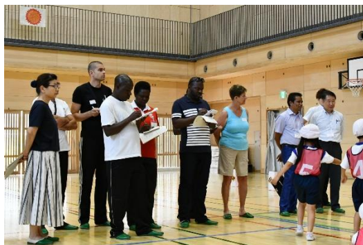
Observation in Primary School