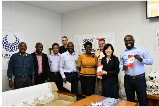
Visit to Sports Agency