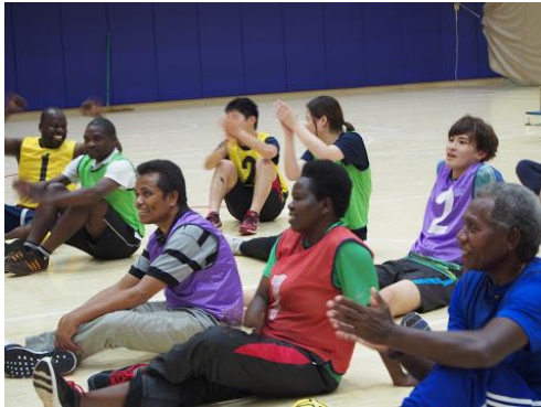
Game for Practical Work